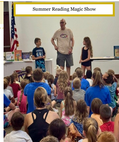
Summer Reading Magic Show

Library usage continued to grow in 2025. Overall borrowing increased by 5.6% compared to 2024, reflecting sustained community engagement. Digital services saw particularly strong growth, with Libby usage increasing by 16.2% and Hoopla usage rising by 29% over the prior year. These trends highlight the expanding role of digital resources in meeting patron needs.