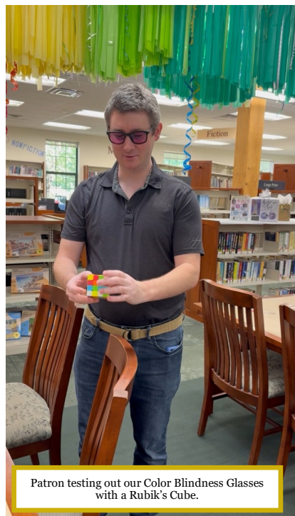
Patron testing out our Color Blindness Glasses with a Rubik’s Cube.

In 2025, the library expanded its Library of Things to include telescopes, color-blindness glasses for adults and children, a C-Pen Reader, children’s puzzles, and puzzles for adults, further enhancing access to educational and recreational resources.