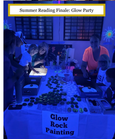
Summer Reading Finale: Glow Party